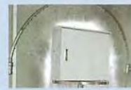
ทดสอบการป้องกันน้ำ /Waterproof Test