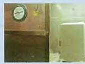
ทดสอบการป้องกันฝุ่น /Dust Proof Test