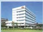
สำนักงานใหญ่ ศูนย์วิจัยและพัฒนา Headquarters Research and Development Center