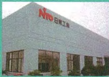
บริษัท นิตโตโคเกียว (เจียงซิง) จำกัด Nitto Kogyo(Jiangxing)Corporation

บริษัท นิตโตโคเกียว (เจียงซิง) จำกัด Nitto Kogyo(Jiangxing)Corporation Factory:No.2,Lushan Road ,Block No.3, Zhejiang Jieshan Economic Development Zone, Zhejiang 314100,China