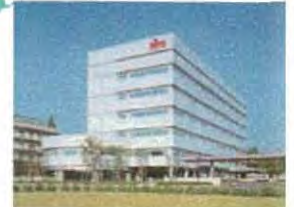
สำนักงานใหญ่ ศูนย์วิจัยและพัฒนา Headquarters: Research and Development Center