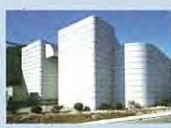
เครื่องมือทดสอบการลัดวงจร Short-circuit test system