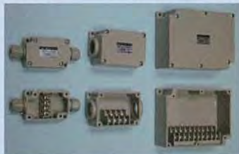
BP14-T4C BP14-T401 BP14-T1001

Paint color Light Beige : 5Y7/1 Application / IP grade IP65 (IP67 for BP14-T401) Material Body : Nylon / Cover : Reinforced PBT