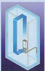
PD-1C Image of dehumidifying process