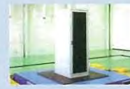
ทดสอบความทนทานต่อการสั่นสะเทือน /Vibration Resistance Test