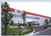
ห้องปฏิบัติการคิกุกาวา Kikugawa Laboratory