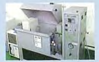
ทดสอบด้วยหมอกเกลือ /Salt Water Spray Test