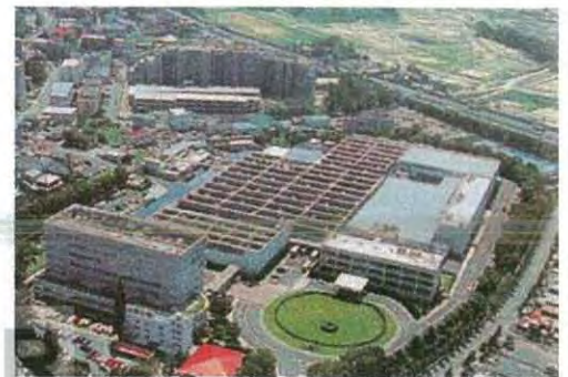
สำนักงานใหญ่ โรงงานนาโกย่า Headquarters: Nagoya Plant